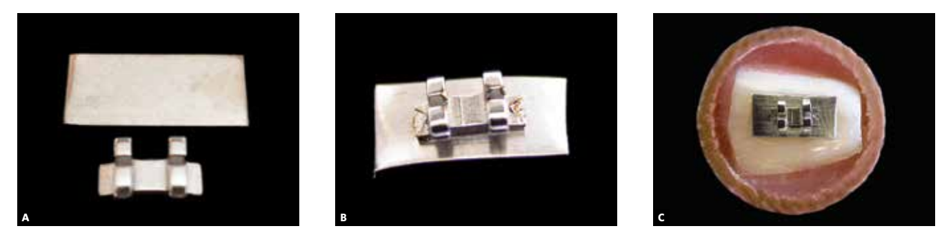
Figure 3 - Metal band strip and bracket used for cementation (A), bracket welded over the band strip (B); band strip cemented to the buccal surface of the crown (C).

For the microhardness test the Micro Hardness Tester - HMV <sup>®</sup> (Shimadzu, JP) was used with a load of 200 g during 15 seconds and the Vickers hardness measurement pattern for all analyses was the standard used.