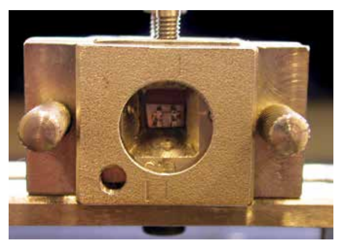
Figure 4 - Specimen positioned in matrix with a loading chisel with 2 mm thickness for the shear strength tests.

Table 1 - Means, Standard deviation and analysis of variance, complemented by the Tukey's multiple comparison test comparing three groups among them for all the mechanical properties analyzed.