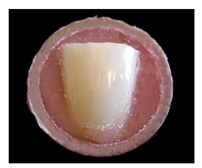
Figure 2 - Bovine tooth sectioned at the cervical third of the root and at the incisal third of the crown and included in acrylic resin.

For the shear strength tests 45 permanent bovine incisors were selected with similar buccal enamel surface characteristics, with no fractures and without deep grooves or stains. With the aid of a diamond disc, teeth were sectioned at the level of the cervical third of the root and with a diamond bur, retention grooves were prepared on the mesial and distal surfaces. The crowns were placed on a slide wax so that the central region of the buccal surface was parallel to the ground. In this position, the crowns were fixed with wax and PVC tubes measuring 20 x 20 mm were placed over the wax with the crown centralized and self-cured acrylic resin was poured into the tubes. After acrylic polymerization the resin specimens were cleaned with Vaporetto® to remove wax excess and so the specimens were ready for cementation procedures (Fig 2).